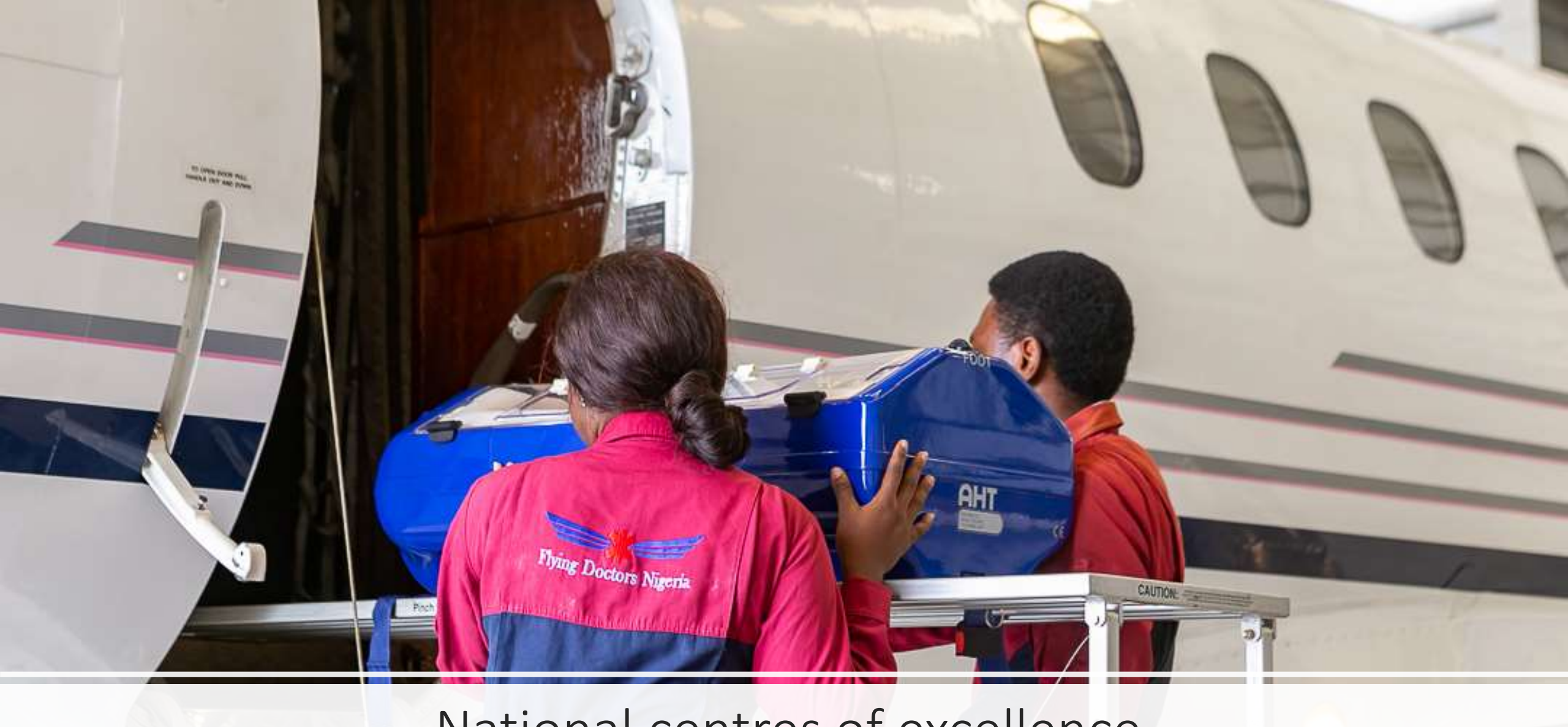
National centres of excellence